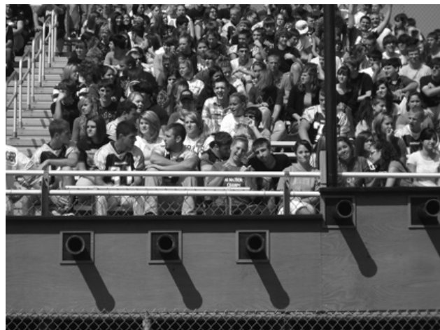
Students enjoy the weather as they get ready to participate in the 2009 Homecoming Pep Rally